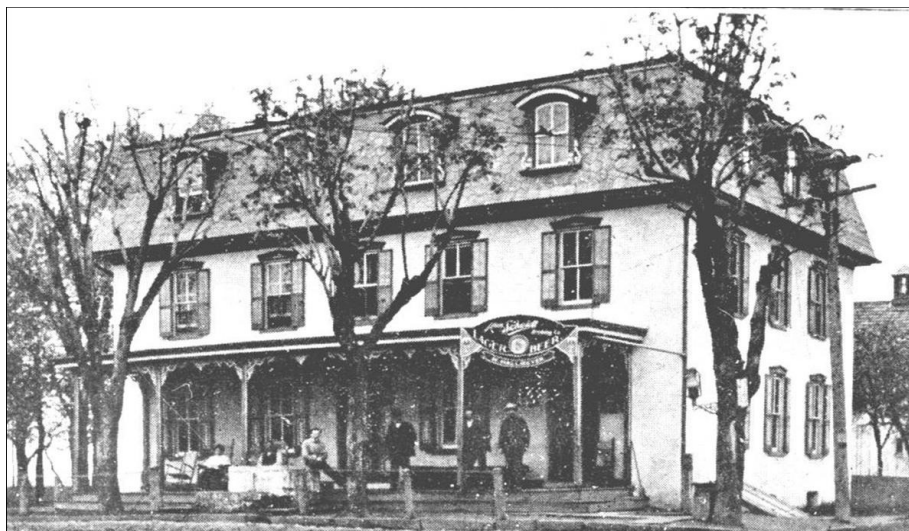
THE WEST POINT HOTEL in Upper Gwynedd, now the Pizza Tyme Saloon.