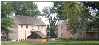
The Jenkins Historic Complex

Lansdale Historical Society 137 Jenkins Ave., Lansdale, PA 19446