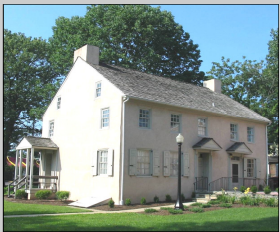
THE JENKINS HOMESTEAD