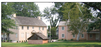
The Jenkins Historic Complex