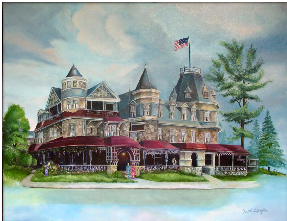
Judith Boyles' Hotel Tremont painting reflects the early 1900s era.

The 1907 Tremont painting is available in two sizes. An 18x24-inch giclee reproduction is priced at $160, an 8x10-inch version is $75.