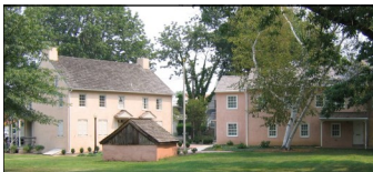
The Jenkins Historic Complex