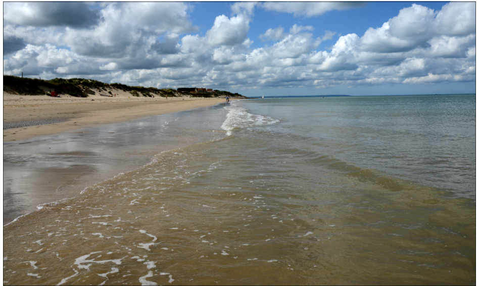
THE BLUE SKIES AND RIPPLING WATERS OF UTAH BEACH 2014

beaches, the American and British cemeteries, Pegasus Bridge and various battlements as well as the French countryside nearby where townspeople continue to revere and honor those young men who were thrust into one of the most significant events of the 20 th century.