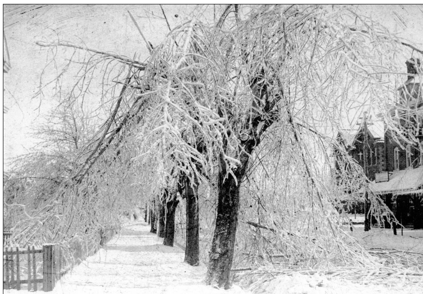
ICE STORMS are nothing new. This turn of the 20th century photo shows what ice and wet snow did to these trees on North Broad Street across from the Music Hall block.

Call (215) 855-1872 before November 27 and leave your name, the number of persons attending and a call-back number in case it is needed.