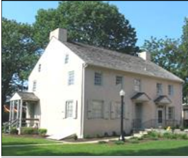
THE JENKINS HOMESTEAD