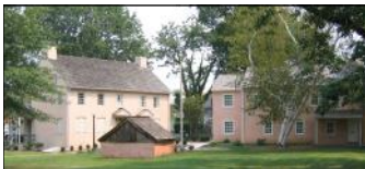
The Jenkins Historic Complex