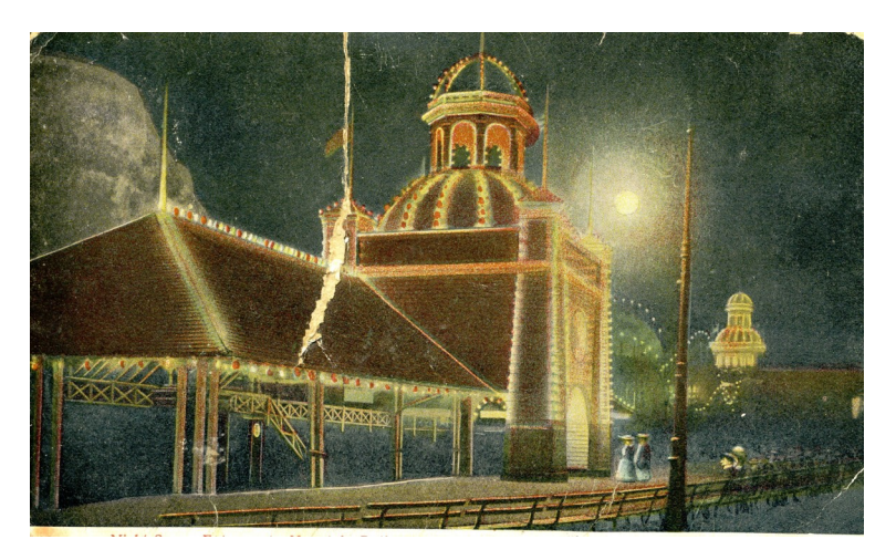
Casino—used for Dining